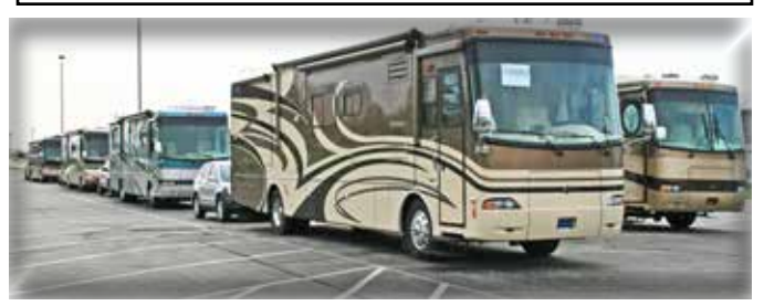
Coaches in line for parking at Goshen.